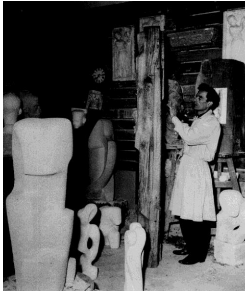
Alfred Basbous working in his workshop - Paris 1961

Mark Hachem Gallery is delighted to present an exhibition of relief and sculpture by artist Alfred Basbous (1924 – 2006). A major pioneer of Modernist sculpture in the Middle East, Basbous drew on the influence of Jean Arp, Constantin Brâncuși and Henry Moore to create stone and bronze sculptures of often monumental proportions. The exhibition brings together a series of sculptures from the 1960's to the 2000's, which demonstrate Basbous' exploration of the relationship between form and material. A selection of Basbous' preparatory drawings which reveal his approach to relief and sculpture are also exhibited.